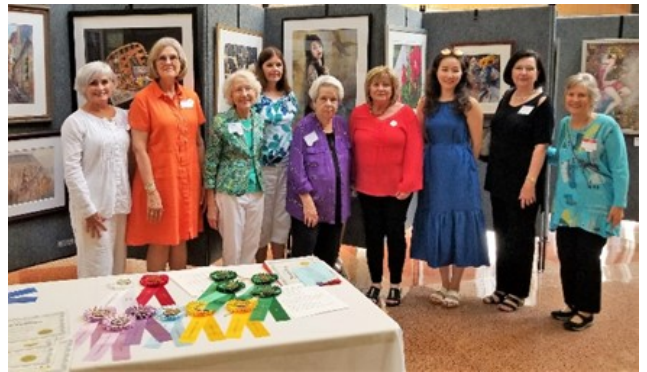
2022 LWS International Awards