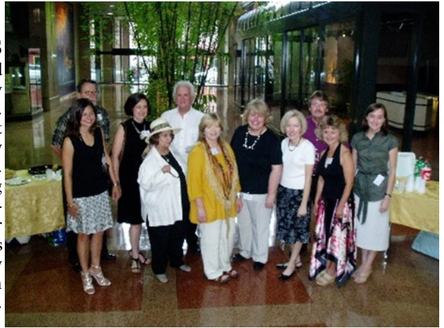
Art friends from way back when...can you name them all?