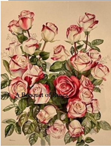
A Bouquet of Roses