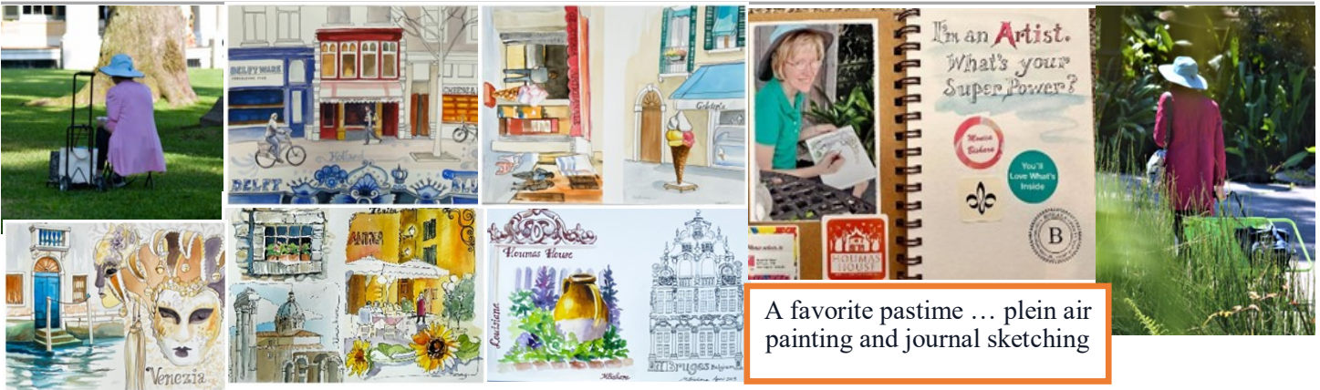
A favorite pastime ... plein air painting and journal sketching