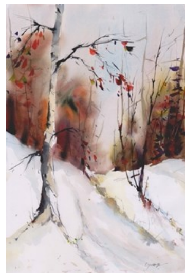
Tom's Trace by Pio Lyons LWS-M