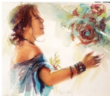
The Obvious by Cheri Fry