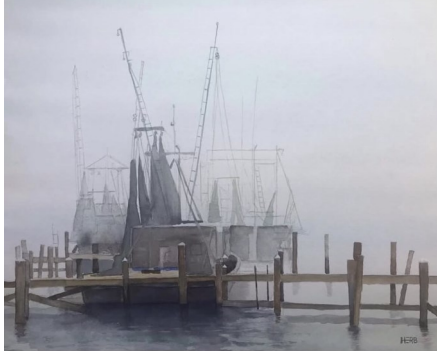
Fogged in Shrimp Boats