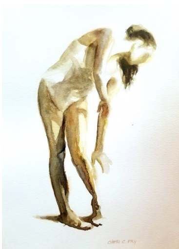
Figure Study Monochrome by Cheri Fry

Cheri's art is found in many permanent collections and has been published in books and magazines. She has signature status with the Louisiana Watercolor Society. More information can be found in her bio on the exhibit link.