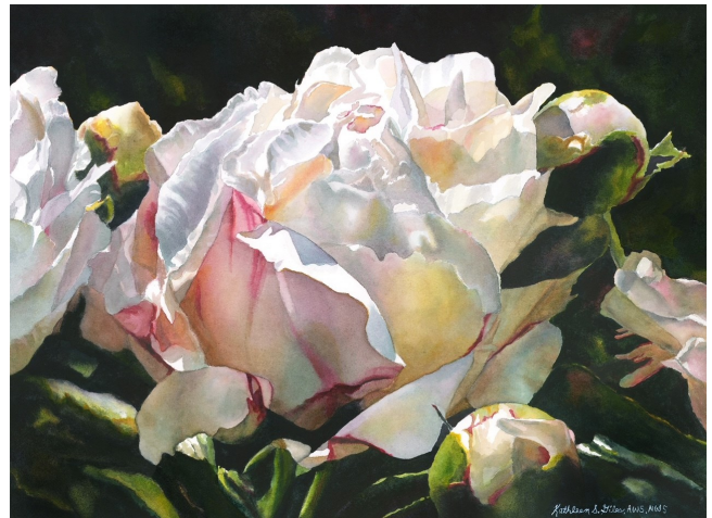
Garden Peony watercolor, Kathleen Giles