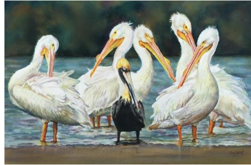
Combination of Techniques