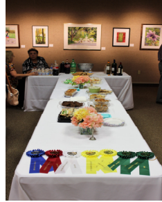
Exhibit dates: March 1-31, 2021