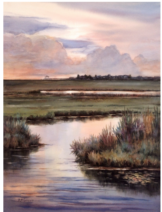
"Marsh of Northshore Beach" by Diane St. Germain LWS