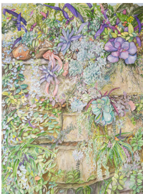
"Nature's Graffiti" by Noel Poche